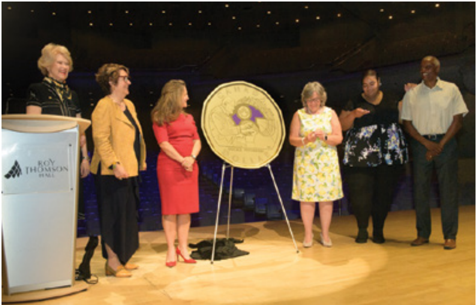
In 2022, the Mint honoured Oscar Peterson, the first musician and Black Canadian to appear on a circulation coin. Mr. Peterson's family helped unveil a commemorative $1 coin at Toronto's Roy Thomson Hall.

Making a positive difference in the lives of our employees, in the communities where we operate, and for Canada in general, is a pillar of our ESG commitment.